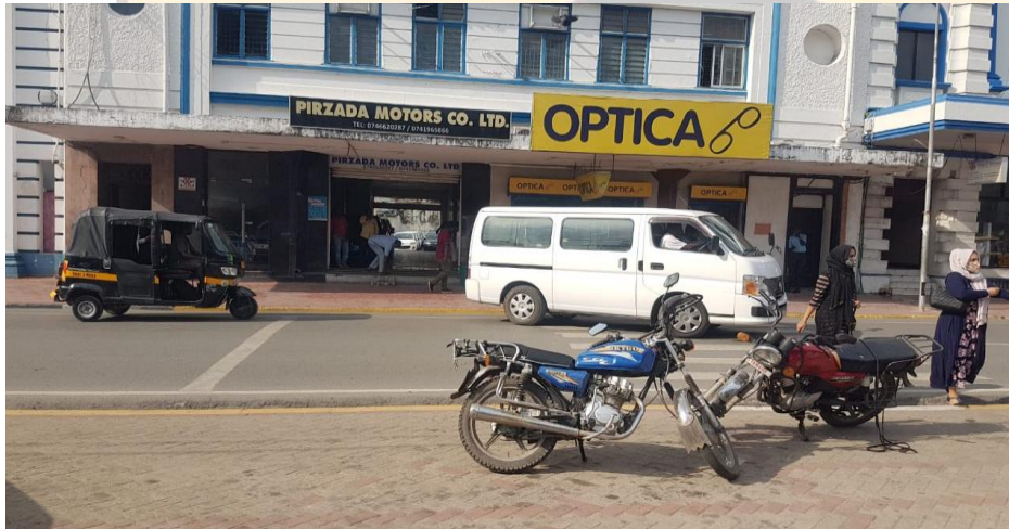
Pic 1: The first van leaving Pirzada Motors Company Ltd

Given that the budget was pegged at KES 1.2M per van, we opted for Petrol engine ones which staggered at around KES 1.3M and KES 1.4M. With much bargaining process, the first van Nissan Caravan was sourced at Pirzada Motors Company Ltd on 24 th Sep and payments made. This was courtesy of Mombasa car brokers that aided in finding one as they advised the vehicle models on search are nowadays nearly out of stock. The vehicle was genuinely Ex-Japan.