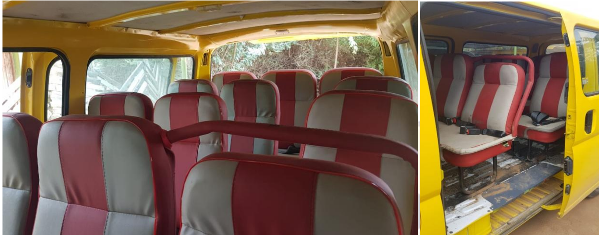
Pic 4: Van seats installed