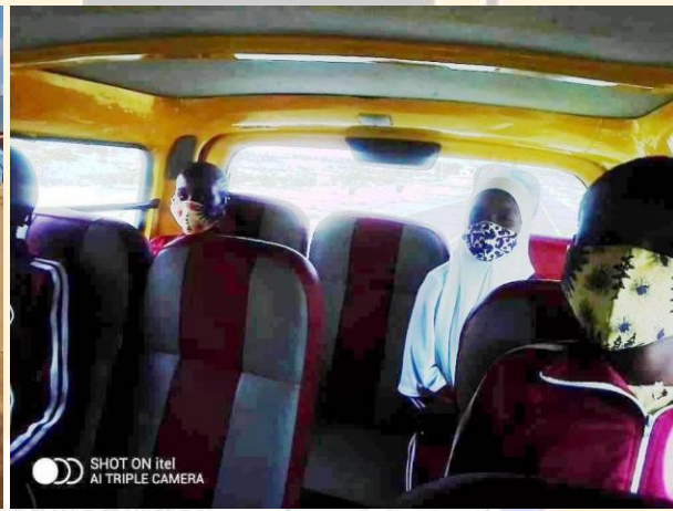
Pic 6 A: Pupils boarding the vans breaking from school in the evening and heading back home. Social distancing is strictly observed with facemask mandate upheld.