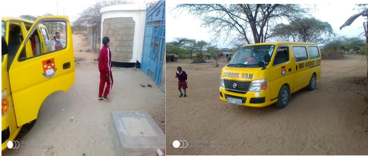
Pic 6 B: Pupils highlighting from the vans in their residential areas.

Fuel allocation is done every Mon after pupils' drop off at the school in the morning, to cater for the whole week. The van operating on the Northern side of the tarmac highway consumes an average of KES 6,000 to KES 8,000 every week while the other is between KES 4,000 to KES 6,000. The vans are not on service during the weekends unless on special circumstances associated with the school.