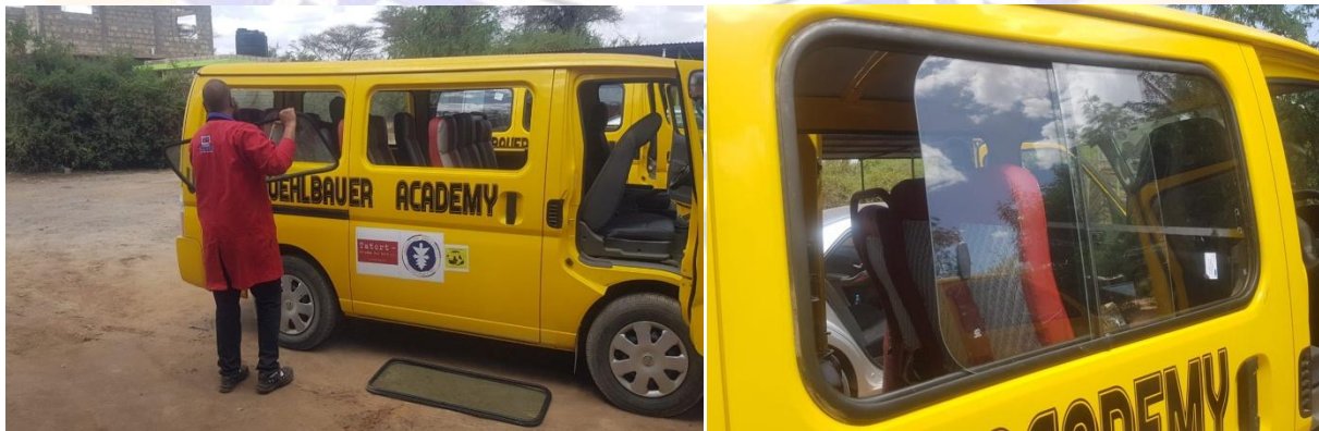
Pic 5: Adjustable ventilated glass windows installations