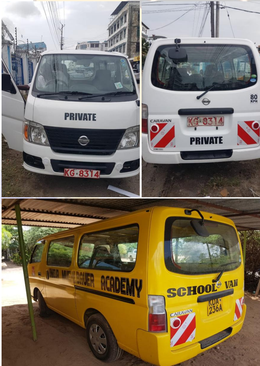
Pic 2: The first van with no registered number plate applied Kenya Garage (KG) plate to allow its movement on highways straight from a car yard. After car inspection on 16 th Oct, the official Registration Plate No: KDA 236A was delivered.

We hired a trusted driver from Nairobi that we are used to, to come down to Mombasa and drive the vans to Archer's Post. The first van from Pirzada Motors Company Ltd had no Registration Plate and Kenya Garage (KG) number plate was applied to allow it to travel. The oil change was immediately conducted and general engine service, fitting of car tracker, chevron and reflectors, and a label in the front and the back – PRIVATE – to avoid Police inquiries on its PSV status that comes along with many other requirements which were unattainable at this stage.