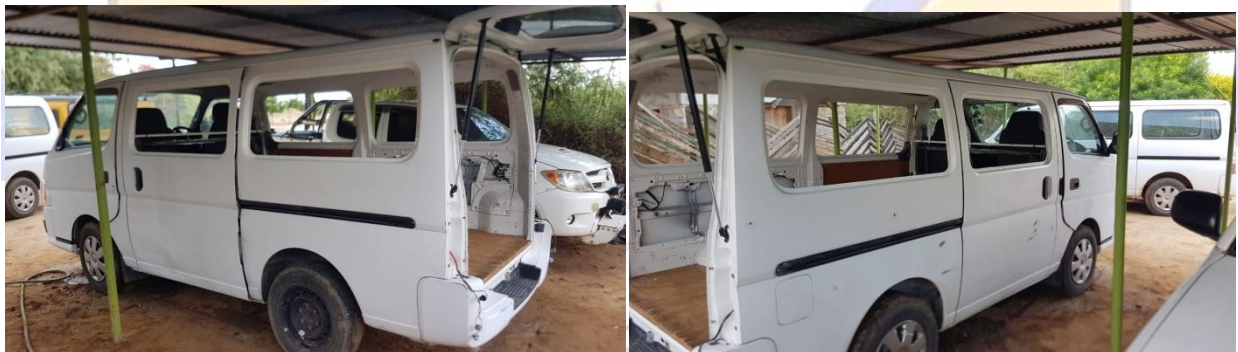
Pic 3: Vans on paintwork changing from White to Yellow colour. This exercise was done at Umoja Camp by mechanics sourced from Meru Town 70 KMS from Archer's Post. It was a good idea not to subject the vans to a mechanical garage fearing loss of original parts by compromised mechanics.

The vans were supposed to be painted Yellow colour in line with the Ministry of Education policy; symbolizing it as a Passenger Service Vehicle (PSV) school van. That happened in Oct, followed by fitting car seats, and eventually applying sponsors' logos. Also, the glass windows were removed and replaced with adjustable ventilated windows. When enhancements were completed, the vans went for a second inspection for Passengers Service Vehicle (PSV), obtained a Transport Licencing Board (TLB) certificate and engine calibrated with a speed governor, and issued a certification; also comprehensive insurance running from Jan to Dec 2021.