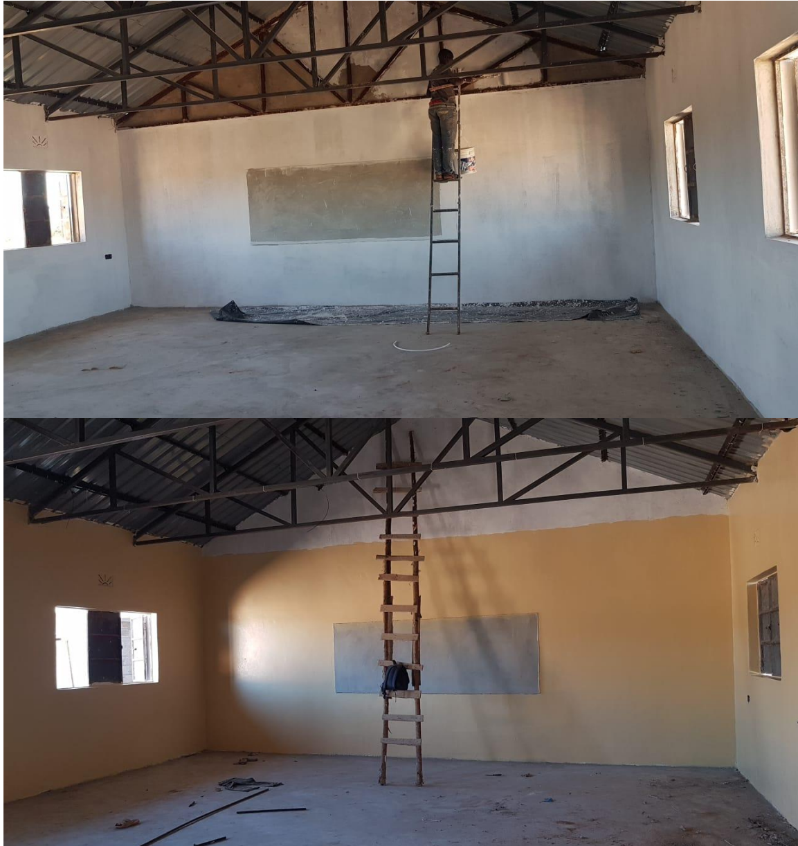
Fig 12: Paintwork began with undercoat of White paint followed by Cream paint for internal walls, Orange for external cobras, Black for wall keys, verandah round poles and bottom skirting; Sky Blue for metallic doors and windows.

On 1 st Jan 2020, paintwork contractor a specialist hired for the work, never hesitated not to celebrate the New Year's Eve and embarked on his work with his crew of labourers. The activity continued for 6 days to conclusion.