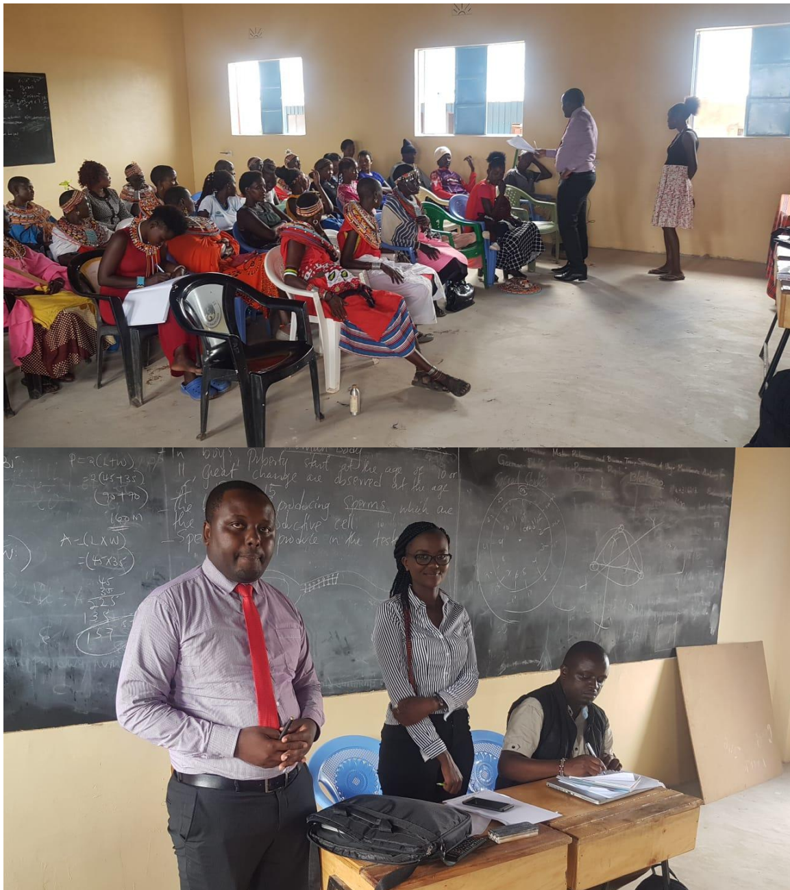
Fig 17: Workshop on Implementation of Law held in Umoja Muehlbauer Academy on Wed 15 th Jan 2020

against women intervention to mainstream; Sexual and Reproductive Health (SRH), Sexual and Gender Based Violence (SGBV), Early Childhood Marriages, FGM as well Menstrual Hygiene Management (MHM)