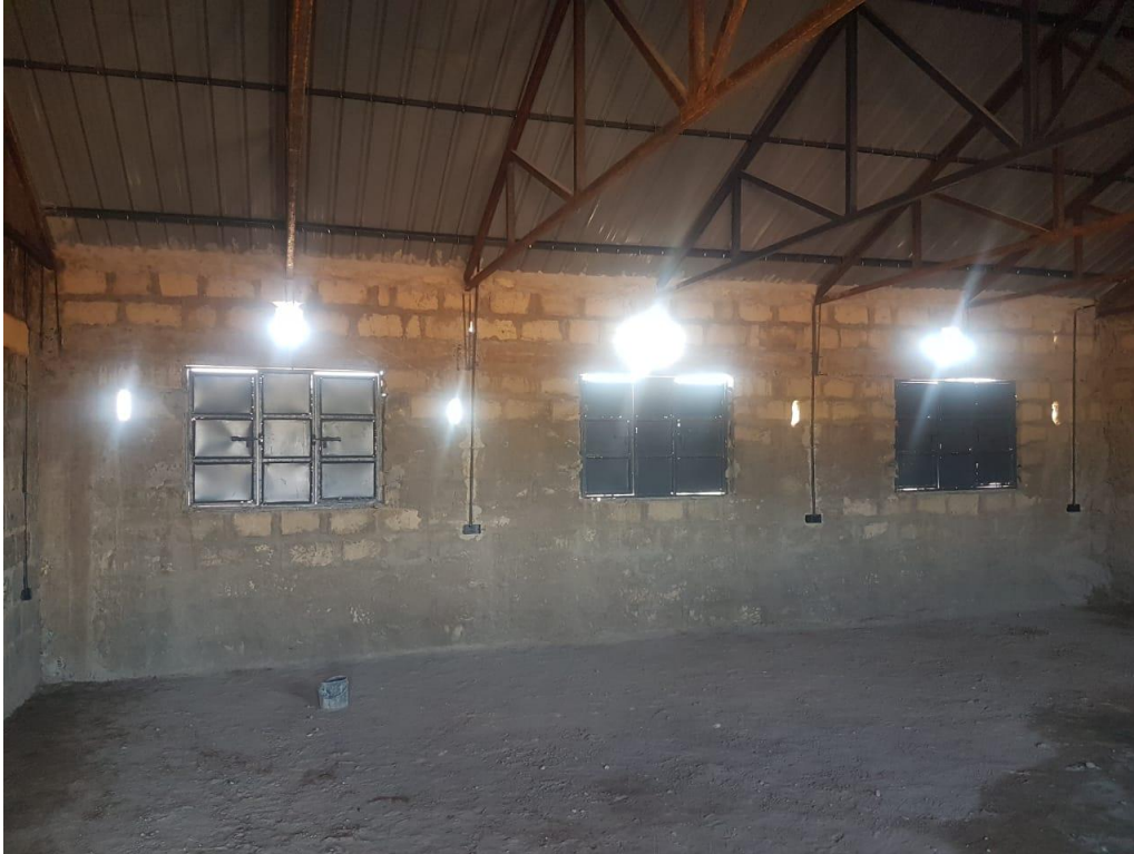
Fig 7: Electricity trunking and piping initiated to pave way for internal wall plastering

Eventually all was set for internal wall plastering and masons were grouped into two working on a class each. On Sat 23 rd Nov the activity began for another two weeks for the whole project. It elicited a need for increased labour and enough were sourced and hired.