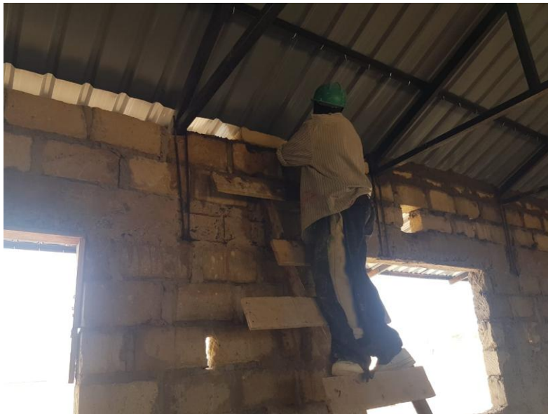
Fig 2: Concrete filling up on open gaps between the roof and the wall top

Actual work commenced on Mon 11 th Nov, concrete filling up of open gaps between the roof and the wall top begun for two days preparing the walls for plastering, see Fig 2.