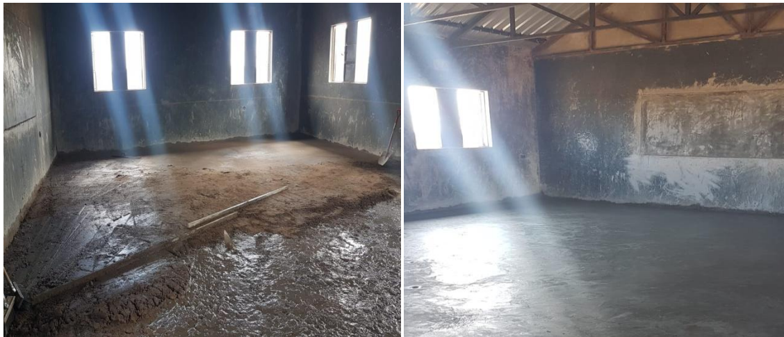
Fig 10: Floor finishes

On Sat 7 th Dec, floor finishes ensued for 7 days. The masons started by hacking floors in about 2 days in order to create the right needed grip between the to-be-applied fresh mortar together with foundation slab base. Eventually mortar was poured and immediately nil spread on top when wet and the process was taking a day per classroom block as nil and concrete can mix only when wet and to ensure a homogeneous floor finish, the work must be concluded within a day.