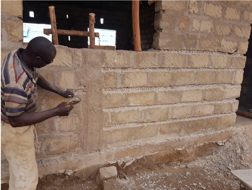
Fig 3: Drilling of walls in a linear manner between the block layers

layers and refilling with mortar leaving a fine and appealing finish. Keying went hand in hand with external Gebo finishes as well as cobras all around the construction project's external walls.