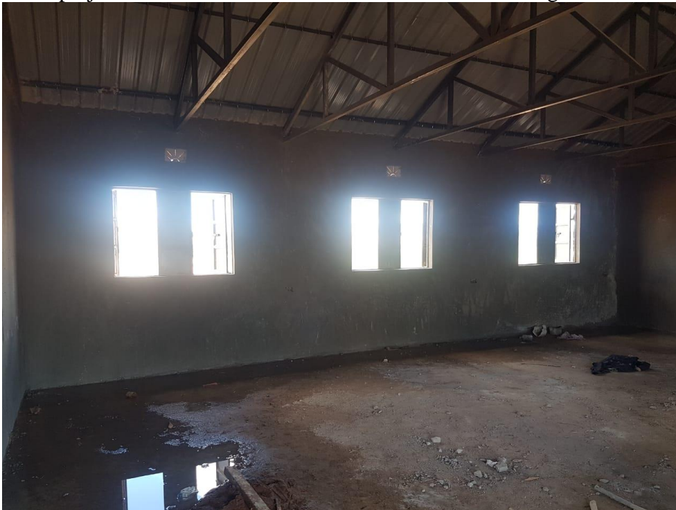
Fig 8: Internal walls plastering was undertaken for two weeks.

Eventually all was set for internal wall plastering and masons were grouped into two working on a class each. On Sat 23 rd Nov the activity began for another two weeks for the whole project. It elicited a need for increased labour and enough were sourced and hired.