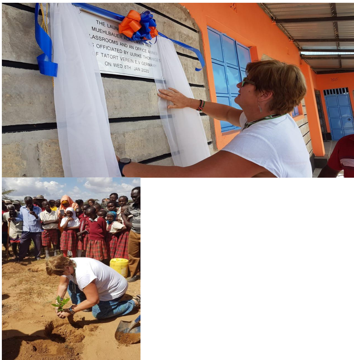
Fig 16: Umoja Muehlbauer Academy launch Four New Standard Classrooms with an Office Annex installed with Cubicle Metallic Lockers

On Wed 15 th Jan 2020, Workshop on Implementation of Law was conducted in Umoja Muehlbauer Academy by a team of two human rights and gender lawyers and one experienced gender specialist. It was attended by women and girls as well as key men of the community.