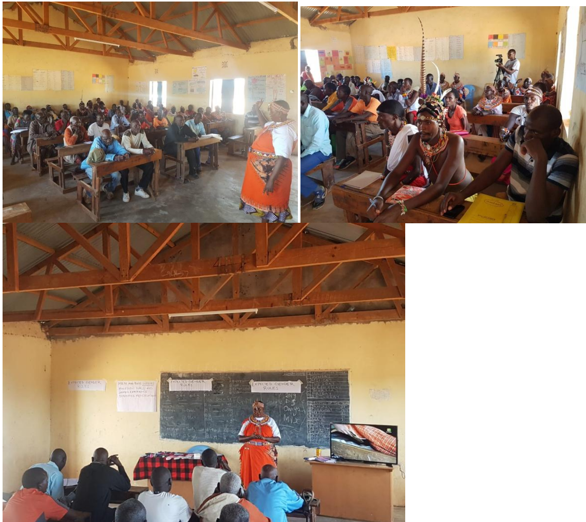
Fig 9: Workshop on Cultural Change held in Umoja Muehlbauer Academy on Wed 27 th Nov 2019 and Thur 28 th Nov 2019.

The essence of the workshop was to elicit men-based workshop to achieve rethinking processes among men who are strongly attached to the traditional way of life and to create a positive ripple effect of the gender message across the society and in the spirit of leave no one behind, and anchoring intervention on SDG 5(Gender Equality) and SDG 10(Reducing inequalities).