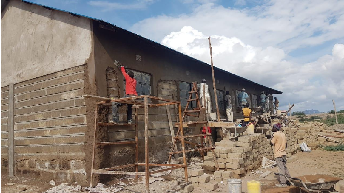
Fig 5: External walls cobras worked on by masons

Earlier on Fri 8th, metallic doors and windows were ordered for construction to be ready in time for fixing and paving way for wall plastering. The order was delivered 9 days later on Sun 17 th Nov and immediately fixing began for three days. Metallic windows was preferred to glass windows because of high cost of repair and maintenance as pupils keep breaking glass windows often prompting the school management in the past to change all windows in old standard classrooms to metallic ones.