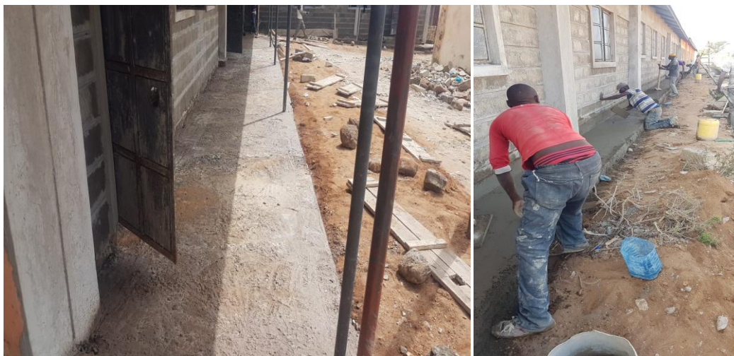
Fig 11: Verandah and pavement construction

Finishes general works continued to ensure an appealing outlook as envisaged in building and construction standards. On Sun 15 th Dec, verandah and pavement setting began all around the construction project. Foundation setting of two courses of blocks was laid all around followed by hardcore filling, smashing and blinding taking 7 days. There was two days break of Christmas and Boxing Day being 25 th Dec and 26 th Dec respectively. Works resumed on 27 th Dec mixing concrete ratios in the day and the following day laying of verandah and pavements slab ensued and its finishes concluded after 5 days and this brought construction works to end.