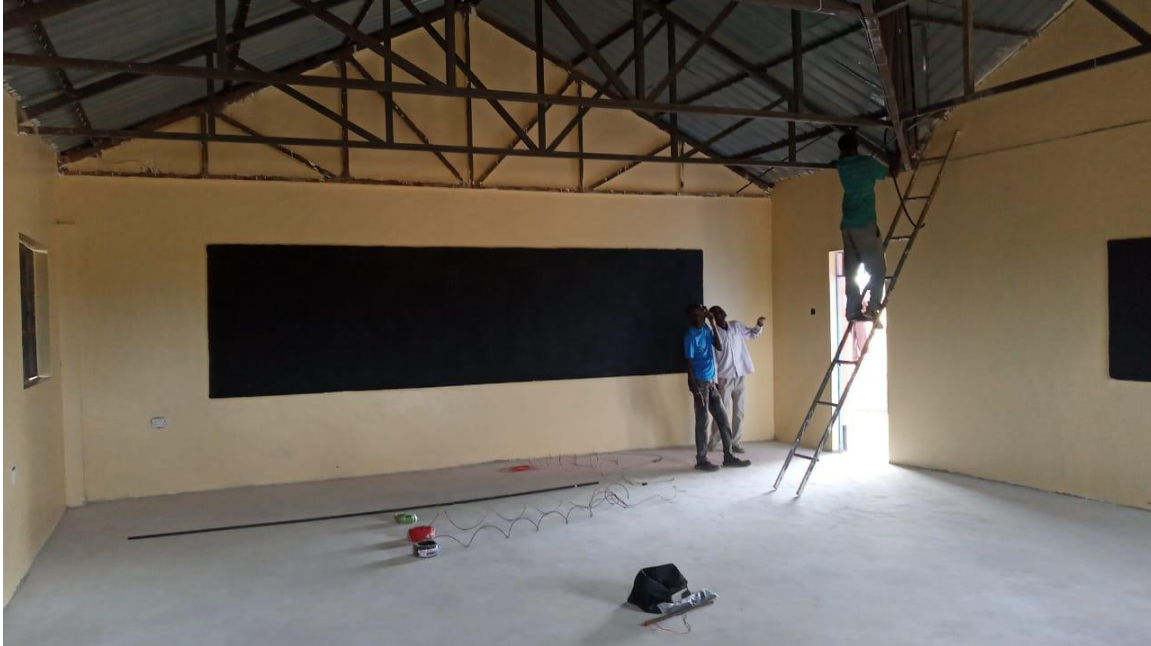
Fig 14: Electricals cabling and installation final touches

Site cleaning clearing debris of construction works and ground leveling in sloppy earth surfaces near the verandahs were leveled by filling up murram and soil, it brought the project to a successful and official completion.