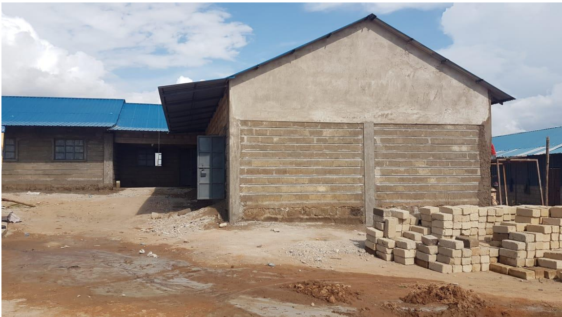
Fig 4: Fine lines of keying after applying mortar, the keying also went hand in hand with external gebo plastering.