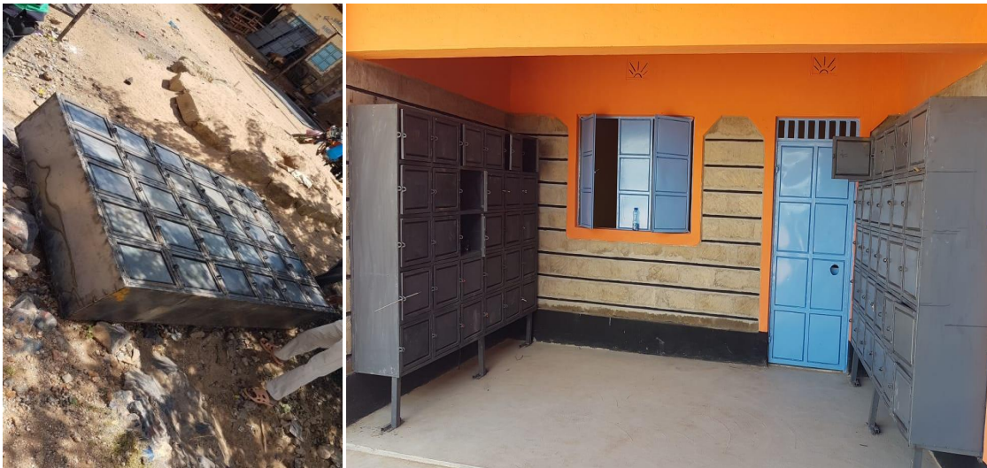
Fig 13: 60 cubicle metallic lockers under construction at contractor's site, delivered and installed in school

On Mon 23 rd Dec, 60 metallic cubic lockers were ordered and they were delivered for installation at the project on 6 th Jan 2020. They were painted metallic Grey. The lockers will be used by Grade 7 and Grade 8 pupils in need of more space to store their bulk valuables safely.