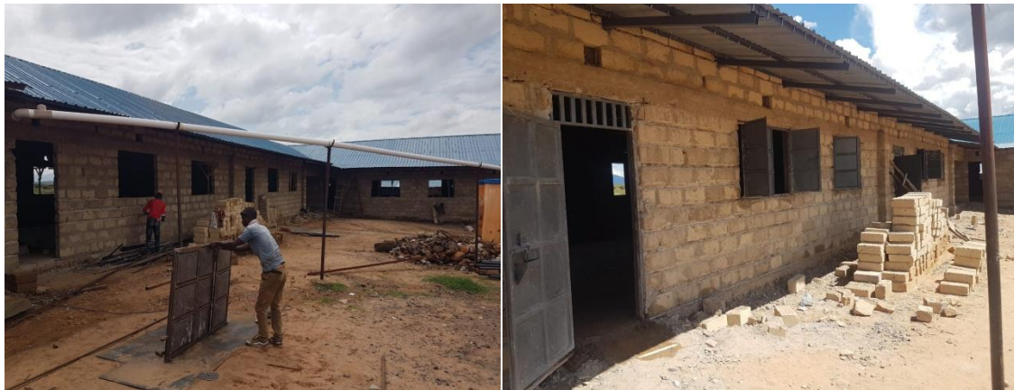
Fig 6: Metallic doors and windows delivered on Sun 17 th Nov and fixing began immediately for 3 days

Earlier on Fri 8th, metallic doors and windows were ordered for construction to be ready in time for fixing and paving way for wall plastering. The order was delivered 9 days later on Sun 17 th Nov and immediately fixing began for three days. Metallic windows was preferred to glass windows because of high cost of repair and maintenance as pupils keep breaking glass windows often prompting the school management in the past to change all windows in old standard classrooms to metallic ones.